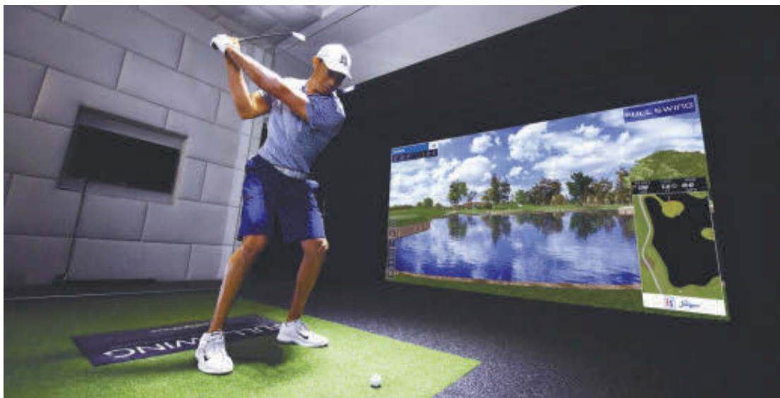
Tiger Woods using the Full Swing Simulator.