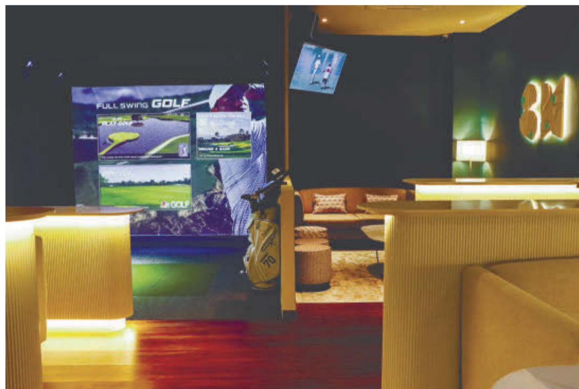
Wedge's mission is to create a new way to play and experience virtual sports, especially golf.

➤ Wedge launches its first Golf-Tech-Social Boutique Lounge & Bar in Kuala Lumpur