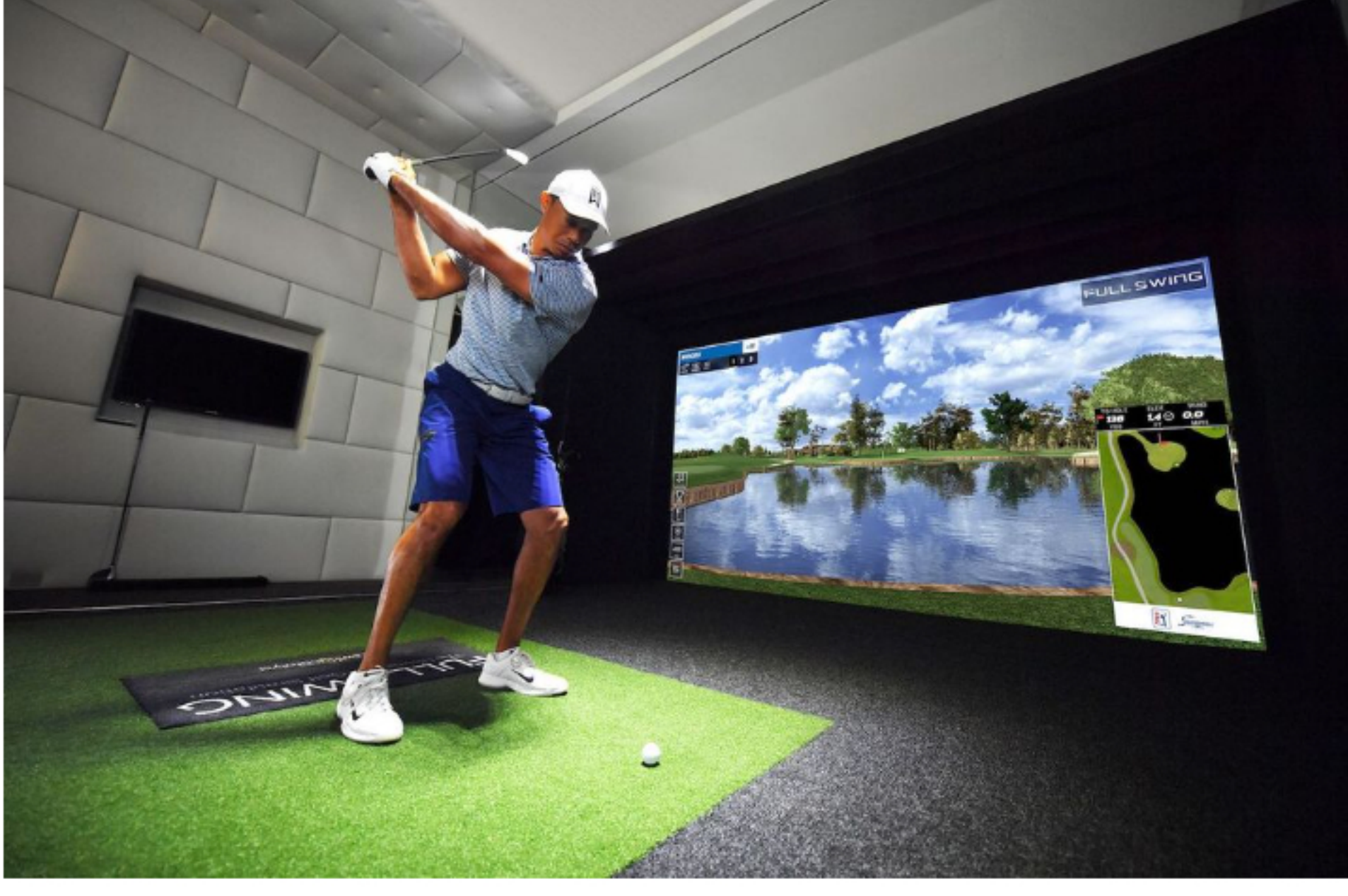
Tiger Woods Sawgrass